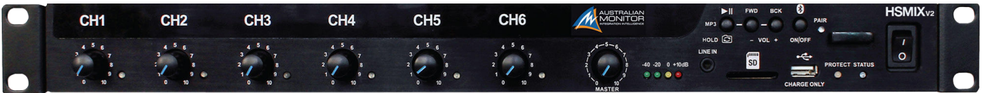
HSMIX v2 Front Panel

The HSMIX v2 now includes an upgraded and programmable Bluetooth 5.1 module allowing customisation of the broadcast name, PIN number and various security features