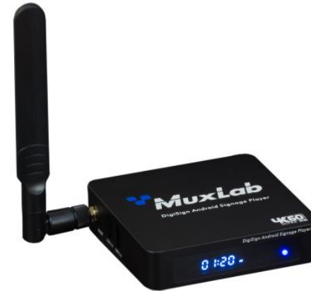
DigiSign Android Signage Player (500799)